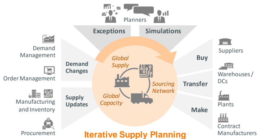
Figure 1. Quickly respond to changes in supply and demand across global networks

Today's supply chains are complex, with multiple tiers of internal and external nodes. Your supply plans must manage a global network of in-house production and distribution facilities, as well as contract manufacturers, drop ship suppliers and outside services providers.